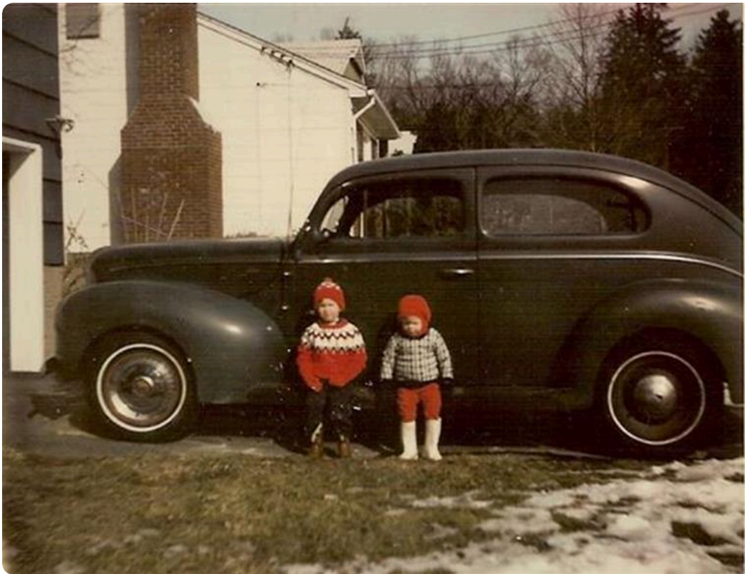
Jim with big brother, Tom, 1969